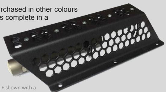
TURTLE shown with a Gefell M 300 cardioid microphone