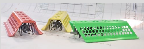
Coloured options are available, shown here with measurement microphones