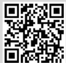
Scan QR code to view details on our website