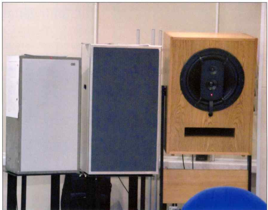
'Historical' loudspeaker arrangement in the large listening room ...

In 1984 the legendary BR 25 hi-fi loudspeaker came to the fore, a product that easily exceeded the international