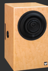
RL 944K Birdseye Maple

"I feel that the Geithain monitors are superior to any other in the test. They interact with a perfect balance of detail, power, frequency-extension, imaging, 3D, transient response, flatness, room integration qualities, and at the same time a wonderful musicality to my ears. All my work seems to translate very "effortlessly" with less processing and less production time."